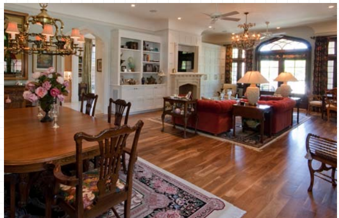
(from left) The particularly distinct clover arch can be seen in both the inset bookcases and the ceiling trusses. Similarly, the gothic arch is evident in everything from door and window frames to the alcoves created in the living room ceiling. Elegant Hardwood Floors installed the impressive hardwood flooring, a beautiful complement to the marble-tiled kitchen and master bathroom.